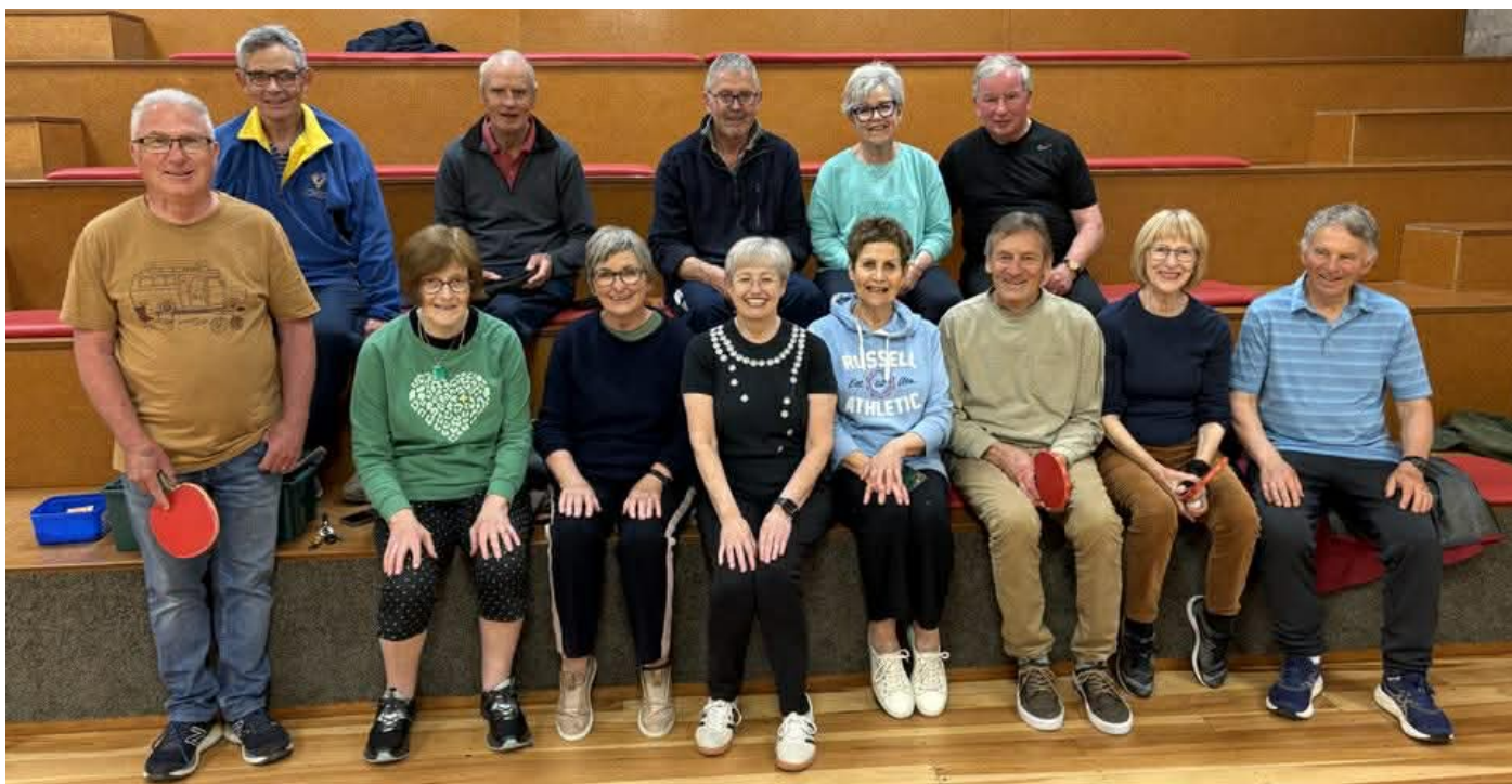
A very happy group of players enjoying their table tennis on Friday afternoons