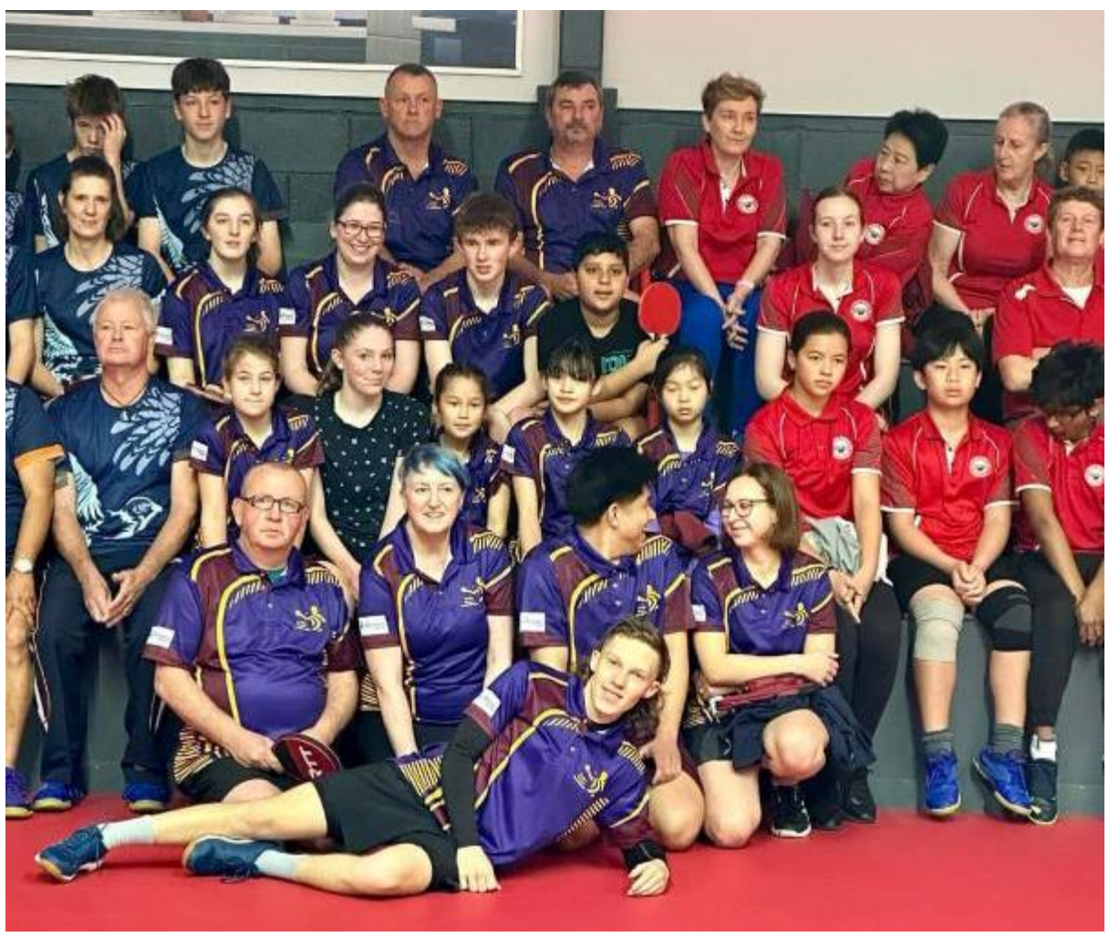
Our team in Christchurch